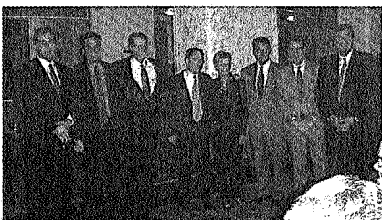
Top Ten Commercial Leasing Award Winners for the Region