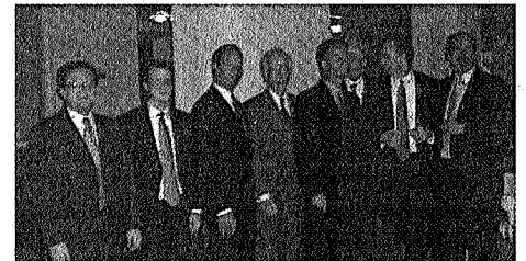
Top Ten Commercial Sales Award Winners for the Region